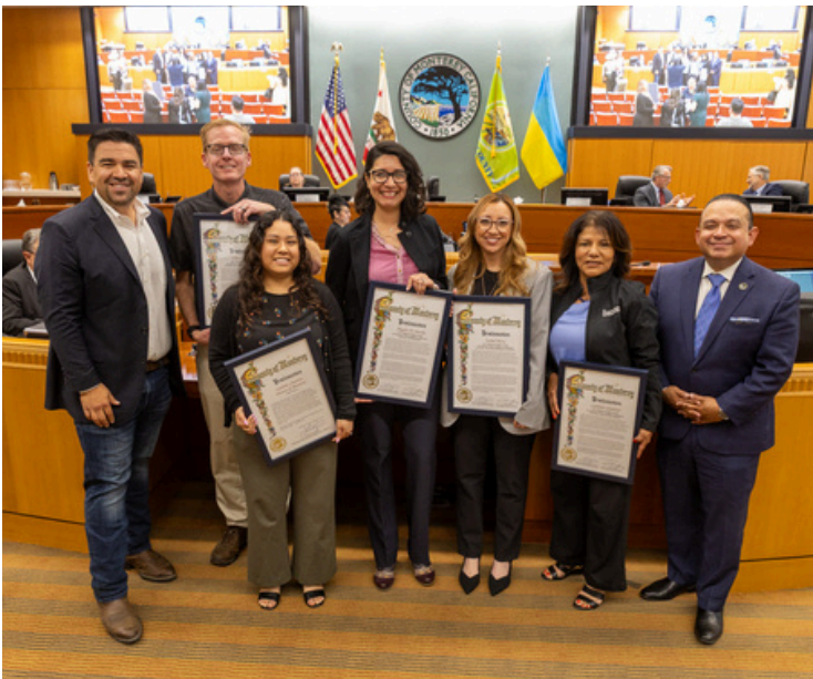
Catholic Charities: Diocese of Monterey was presented with Proclamations for our work at the Immigration Forums

Catholic Charities Diocese of Monterey is deeply honored for the Proclamation received from the Monterey County Board of Supervisors in recognition of our work supporting immigrants through our recent Immigration Forums.