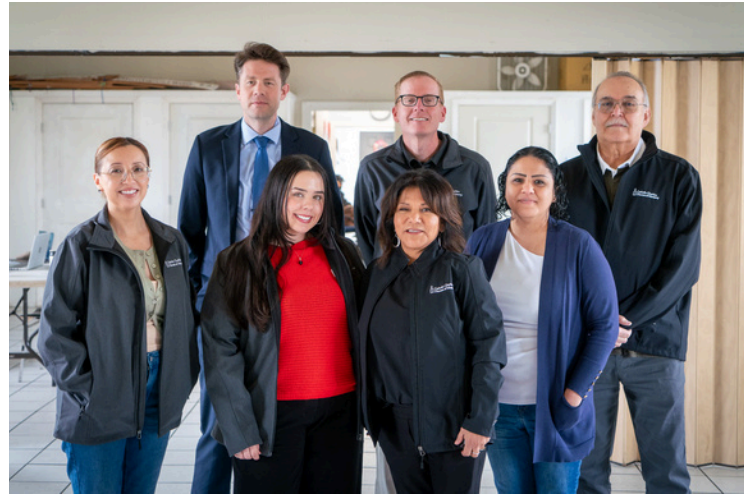
Immigration legal team

Our Immigration Forums are designed to empower community members with knowledge about their constitutional rights, legal updates, and available pathways to citizenship or legal residency. These events often feature presentations from our Department of Justice-accredited legal team, immigration attorneys, and local partners who bring years of experience and insight to help break down intimidating legal processes. Attendees leave with more than just information—they leave with a plan, trusted legal guidance, and reassurance that they're not alone.