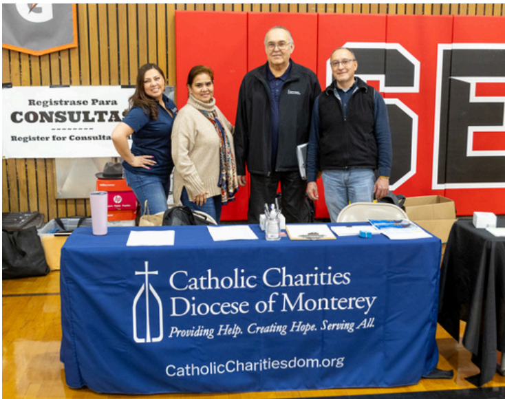
Our team members at the Seaside immigration forum

Our presence in communities like Watsonville, Hollister, Salinas, Greenfield, Paso Robles, and Santa Maria reflects our commitment to reaching underserved and rural areas where access to trusted immigration services can be limited. We work in close collaboration with churches, local schools, nonprofit partners, and volunteers to ensure that everyone has access to services, especially the most vulnerable. These services are a bridge to a better life. For many, our immigration legal work is the first step toward reuniting families, gaining lawful employment, or finally feeling safe in the place they call home.