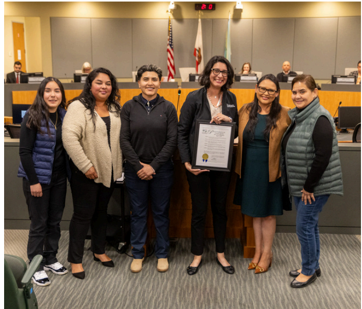
Catholic Charities Diocese of Monterey being recognized by the Watsonville City Council